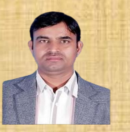
Dr. Shatrughan Bhardwaj, Department of Higher Education,Ministry Of Education, Government of India, India